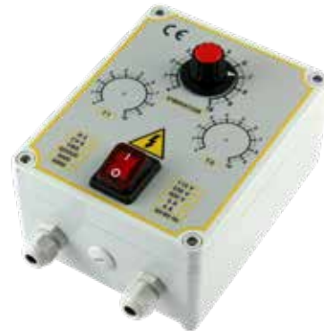
PLASTIC BOX PV R5FCX Z2 STD 165x130x70