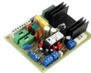
CIRCUIT PV R5FCX A2 STD