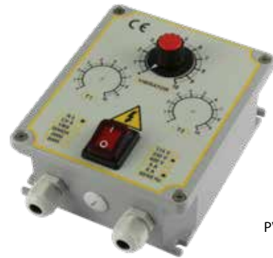
METALLIC BOX PV R5FCX Z2 STM 165x140x65