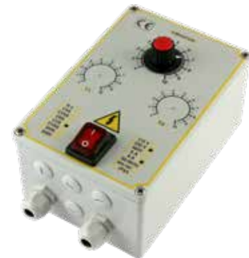
METALLIC BOX PV R5FCX Z2 SM3 195x130x90