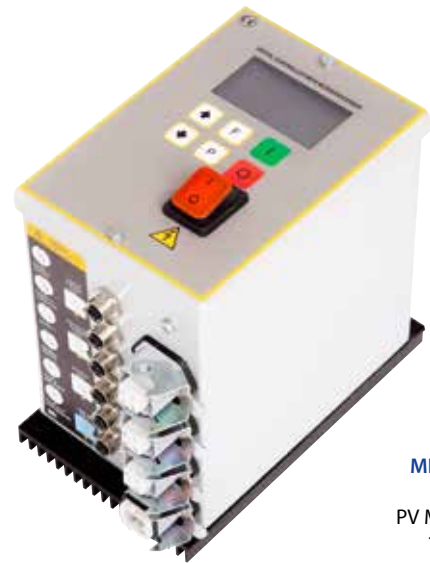
METALLIC BOX MTR01 DIG PV MTRDI Z6 INV 130x180x190