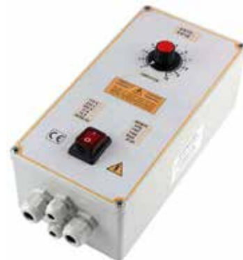
METALLIC BOX PV C1217 Z4 SM1 PV C1517 Z4 SM1 265X130X90