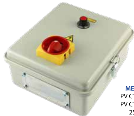
METALLIC BOX PV C1217 Z4 STD PV C1517 Z4 STD 250X200X130