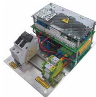
CIRCUIT CV10F PV C1217 A4 STD PV C1517 A4 STD