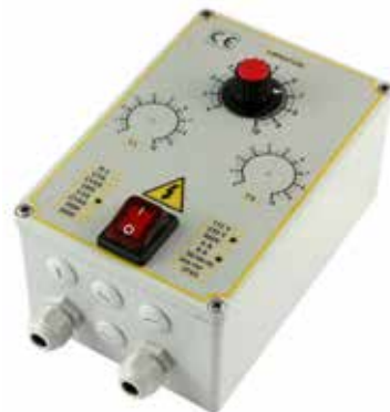
METALLIC BOX PV C1217 Z2 SM1 195x130x90