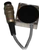
SENSOR SIND3 PV SIND3 A2 STD