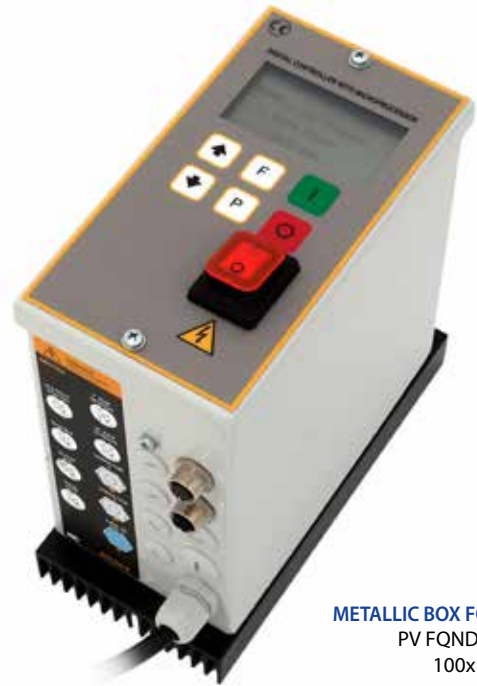
METALLIC BOX FQ1N DIG PV FQNDI Z2 STD 100x180x190