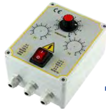
PLASTIC BOX CV8FS PV CV8FS Z2 SM1 195x130x90