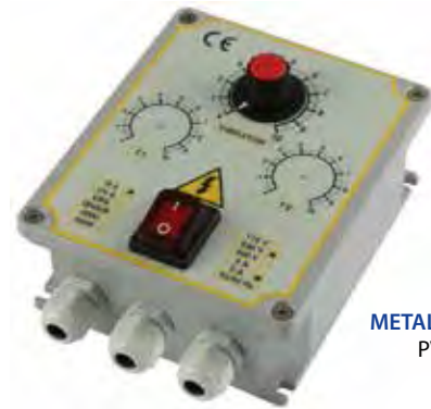
METALLIC BOX CV6FS PV CV6FS Z2 STM 165x140x65