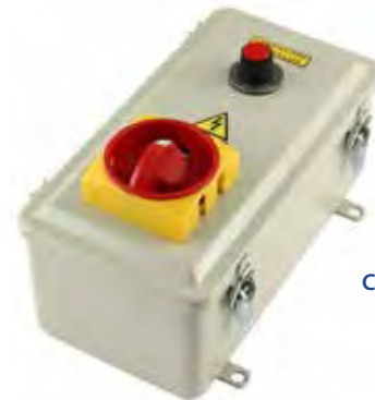
METALLIC BOX CV6FS/ CV8FS/CV10FS PV CV6FS Z2 STD PV CV8FS Z2 STD PV CV10S Z2 STD 195x130x90