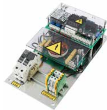
CIRCUIT PV CV20F A4 SSD PV CV24F A4 SSD