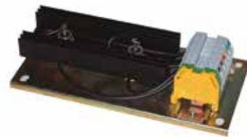
MODULE DOUBLE OUTPUT PV MOD2U AX EXT