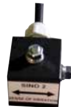
SENSOR SIND2 PV SIND2 ZX STD